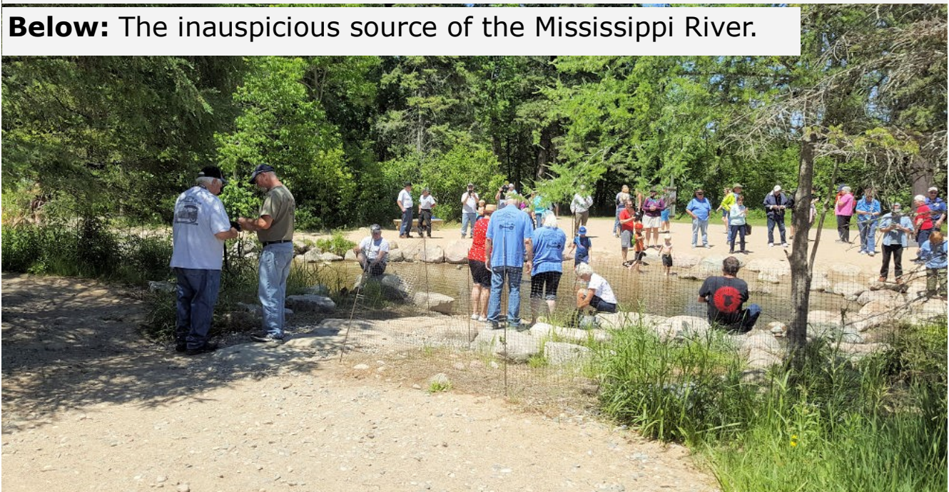
Below: The inauspicious source of the Mississippi River.